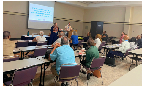
CommunityWorks co-hosting a workshop on Congregations as Connectors