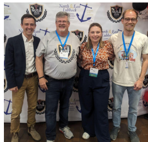
CommunityWorks with 3Sixty, University of Missouri Extension, and The Neighboring Movement