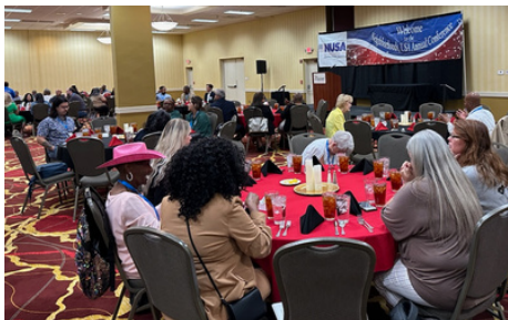
Participants at NUSA Awards Luncheon